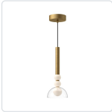
PD30502-BG/CL Brushed Gold/Clear